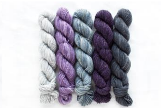
Kit 2 - Beatrix