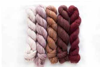
Kit 5 - Eleanor

Other suggested mini-skein kits to choose