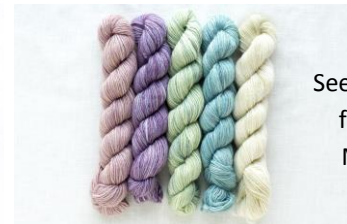
Kit 8 - Henrietta

See www.roosteryarns.com for more colours in the Manos Silk Blend Fino.